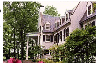
Convocation XIV will be held on July 31, 2005 at the beautiful Nittany Lion Inn

Registration will cover the cost of the event and food. Participants will need to make sepa-